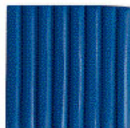
Reverse: Eight segments

Each FIMO CLASSIC block consists of eight segments, helping you to mix precise colours.