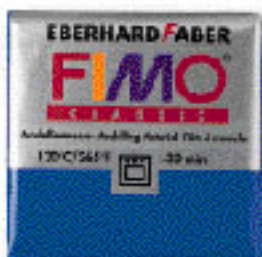
FIMO-CLASSIC 63g - Block

Are you a real expert? Then there is interesting news for you: Good old FIMO has turned FIMO CLASSIC. Its formula has remained unchanged: still the best quality for filigree modelling. All the colours can be combined with FIMO SOFT. Well, what's new then? We have optimised the colours in terms of blending. Which gives you the choice of a vast palette of intermediate hues. There are 24 standard colours which blend into 100 different shades as shown in our blending table on the reverse. Just choose your favourite.