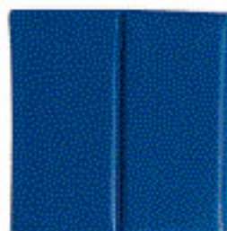
Front: Two segments